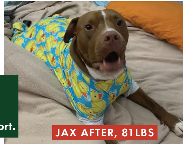
JAX AFTER, 81LBS