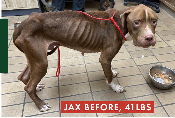
JAX BEFORE, 41LBS

Please send your urgently needed donation now. We cannot help animals like Jax without your support.